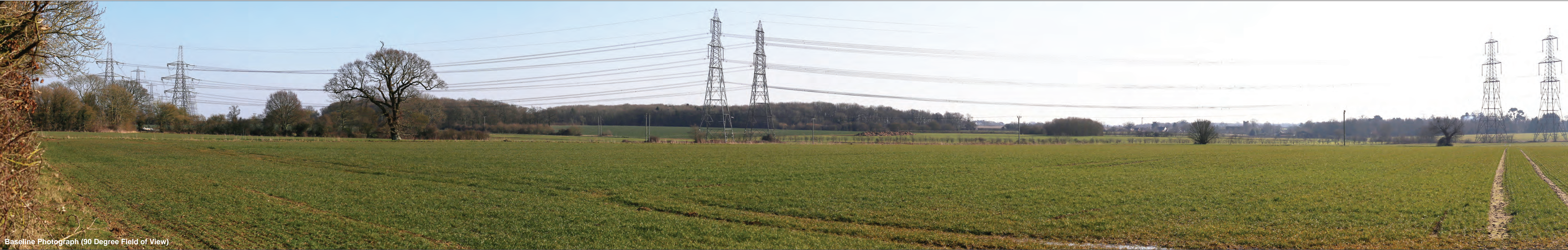
Baseline Photograph (90 Degree Field of View)