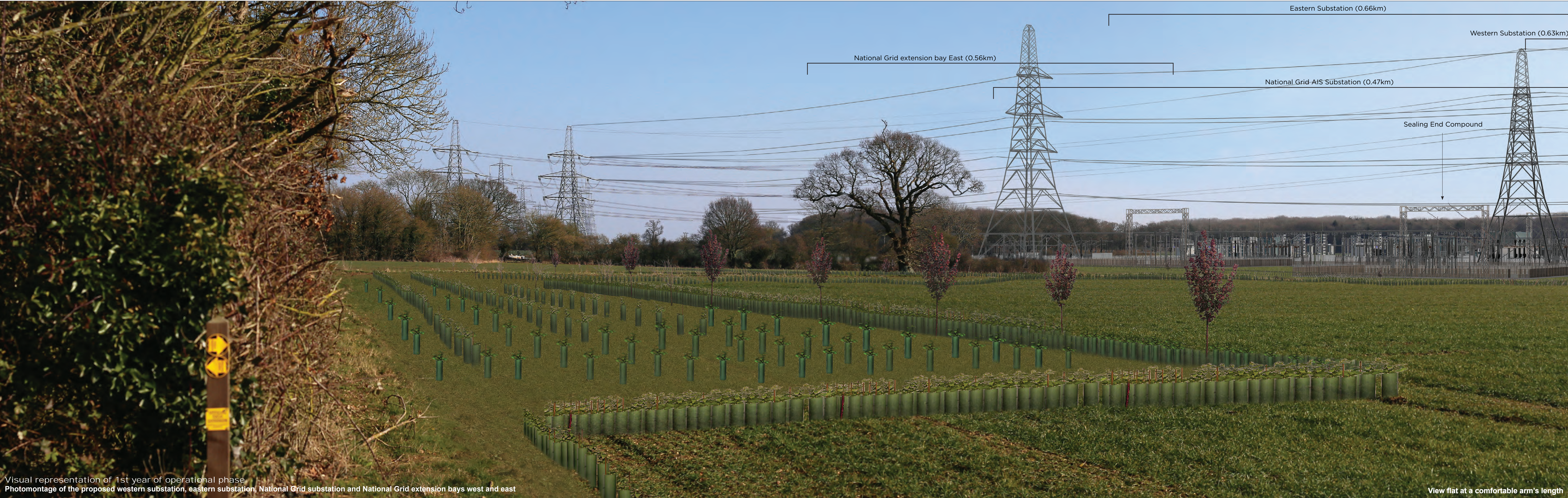
Visual representation of 1st year of operational phase Photomontage of the proposed western substation, eastern substation, National Grid substation and National Grid extension bays west and east