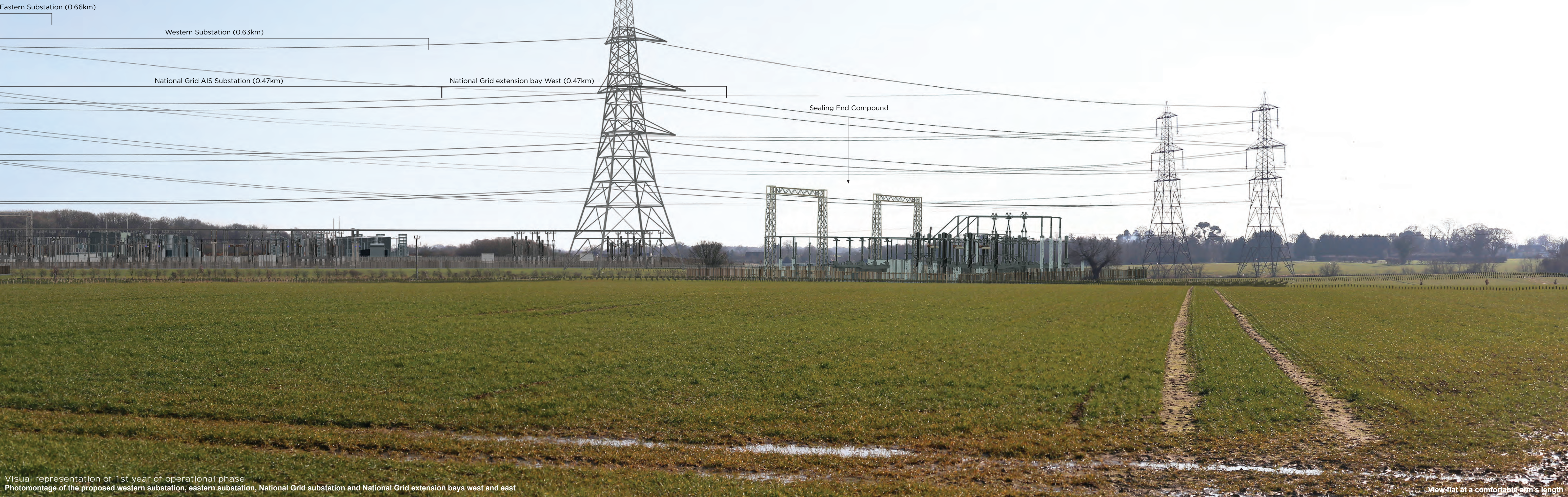
Visual representation of 1st year of operational phase Photomontage of the proposed western substation, eastern substation, National Grid substation and National Grid extension bays west and east