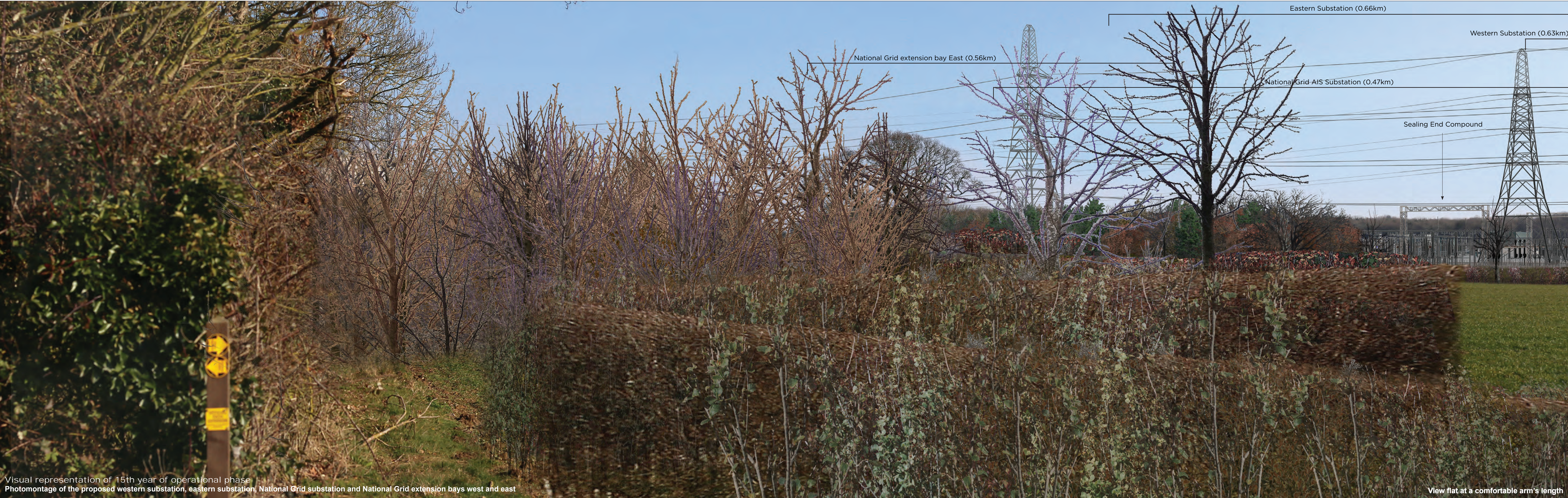
Visual representation of 15th year of operational phase Photomontage of the proposed western substation, eastern substation, National Grid substation and National Grid extension bays west and east